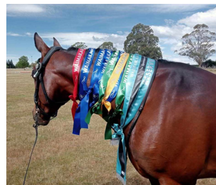
Various other winners